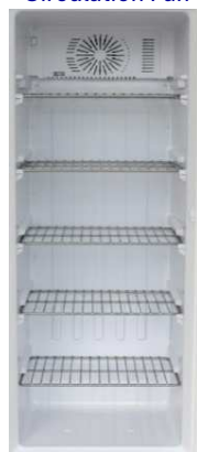
SUS304 Shelf Model CID-02